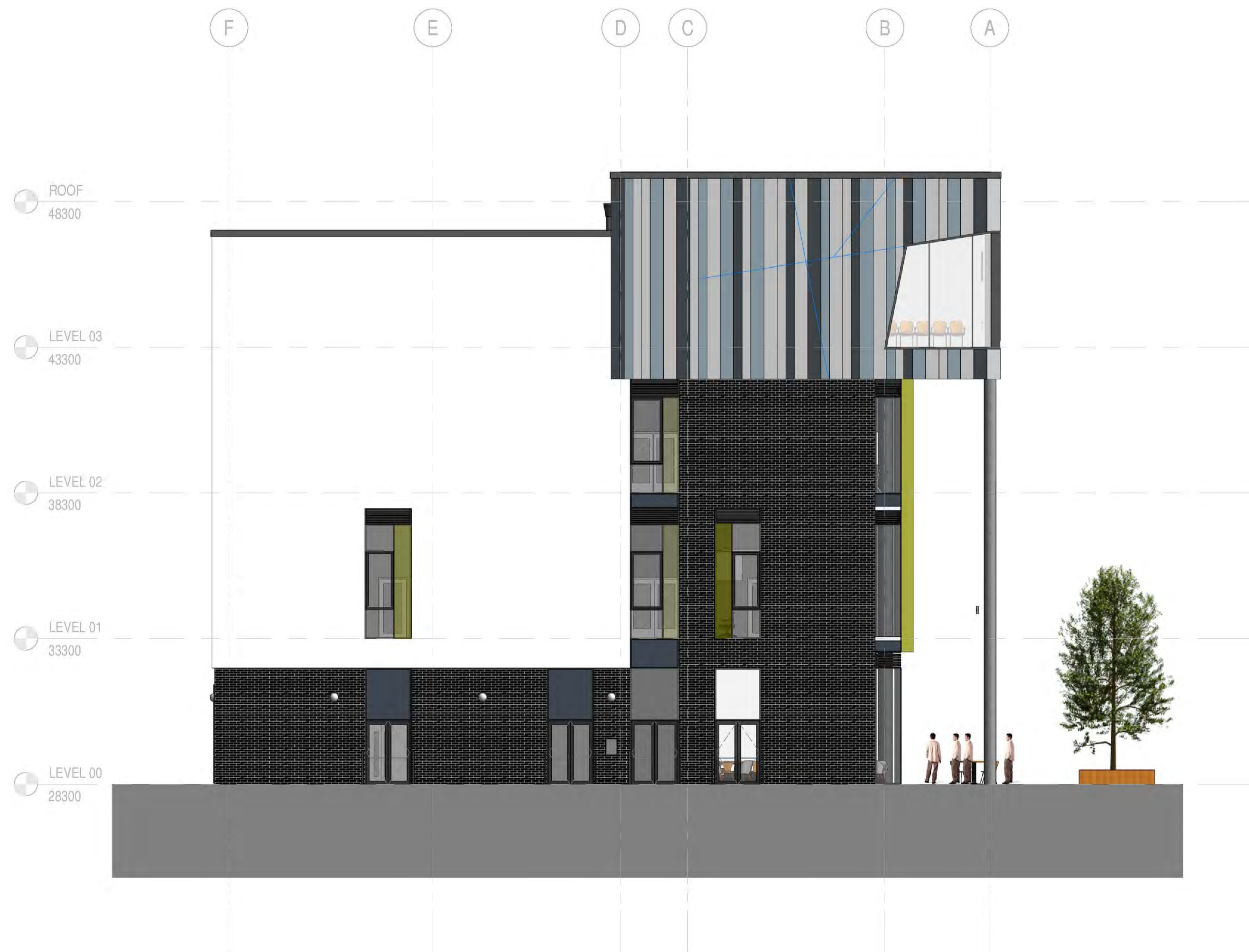
1 ELEVATION NORTH 1 : 100